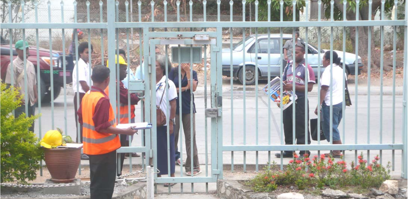
FILE PHOTO: Security guards at the PNG Ports Head Office carrying out the last breathalyser tests last year outside the main entrance to the Head Office.

P NG Ports Corporation Limited (PNGPCL) has successfully completed a breathalyser testing program at its major ports and the program is being pushed for implementation at the other ports.